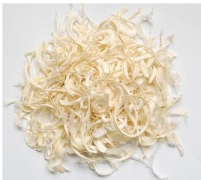
Dehydrated onion flakes